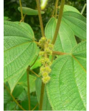
60 C. capitulata (flowers)