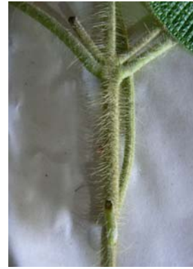
89 U. Zag 480 (detail)