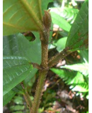
90 M. matthaei (detail)