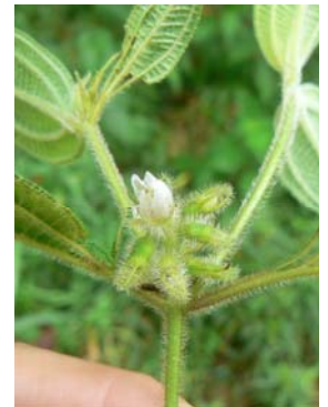
50 C. dentata (flowers)