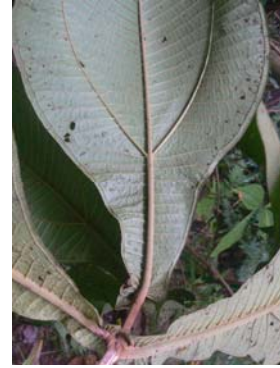
34 M. amplexans (lf. base)