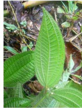
54 C. hirta (lower lf. surface)