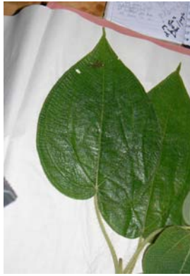
87 U. Zag 480 (upper lf. surface)

Miconia sp (480) (photos 87-90) Habitat: Forest. Habit: Shrub. Height <2m ID tip: Short.