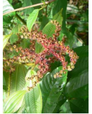
80 M. lacera (flowers)