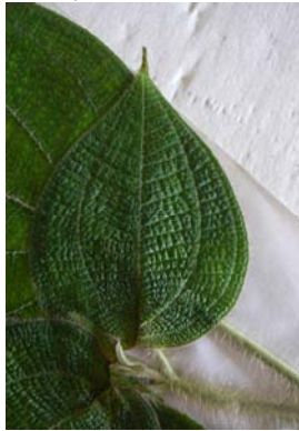
87 U. Zag 481 (upper lf. surface)

Miconia sp (481) (photos 87-90) Habitat: Forest. Habit: Shrub. Height <2m ID tip: Short.