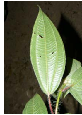
89 U. Zag 482 (lower leaf surface)