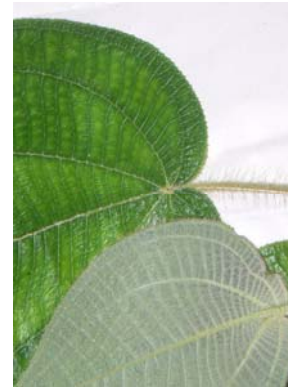
90 U. Zag 481 (detail)