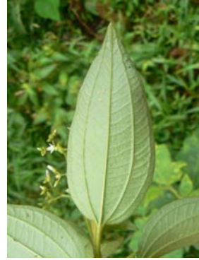
74 U. Zag 239 (lower lf. surface)