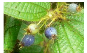
55 C. hirta (flowers/fruits)