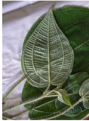
88 U. Zag 480 (lower lf. surface)