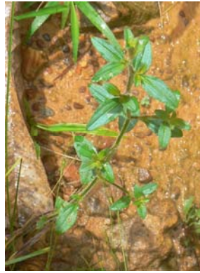
3 A. quadrata (habit)

Habitat: Open, wet ground. Habit: Delicate herb. Height: <30cm ID tip: Tiny herb, square stem, large scythe-shape anther connectives.