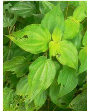
63 L. mexicana (upper lf. surface)