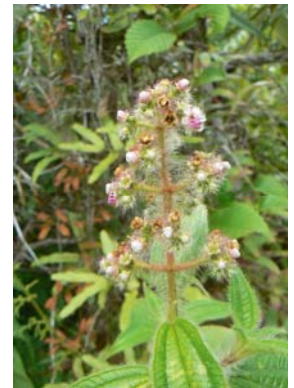
90 U. Zag 538 (flws)