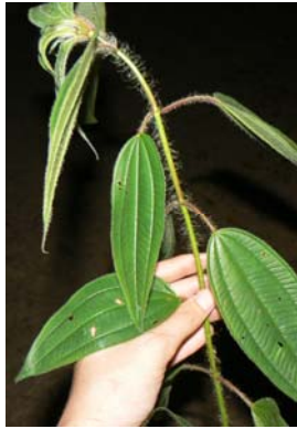
87 U. Zag 482 (habit)

Miconia sp (482) (photos 87-90) Habitat: Forest. Habit: Shrub. Height <2m ID tip: Short.