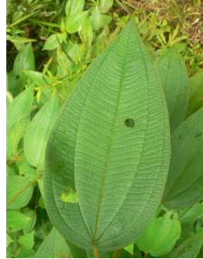
58 C. capitulata (upper lf. surface)