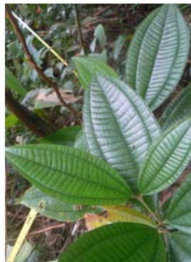
67 M. hyperprasina (upper lf. surface)