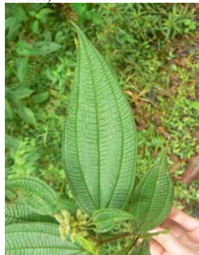
48 C. dentata (upper lf. surface)