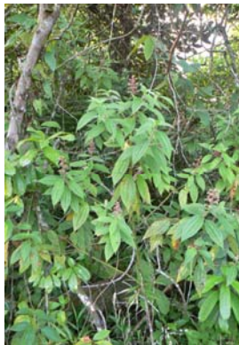
87 U. Zag 538 (habit)

Miconia sp (538) (photos 87-90) Habitat: Forest. Habit: Shrub. Height <2m ID tip: Short.