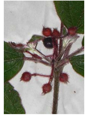
90 U. Zag 481 (fruit)