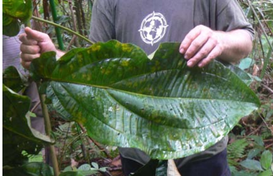
37 U. zag 229 (upper lf. surface)

ID tip: Large leaves (70x30cm), with unusual venation.