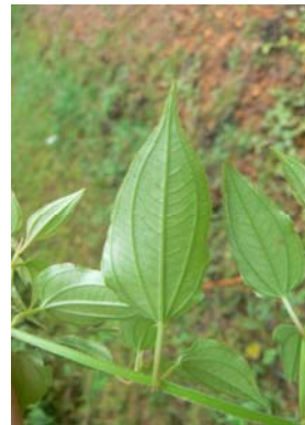
9 A. ciliatum (lower lf. surface)