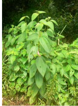
57 C. capitulata (habit)

ID tip: Axile inflorescence, white flowers.