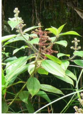
77 M. lacera (habit)

Habitat: Open, disturbed vegetation. Habit: Small shrub. Height: <2m ID tip: Long (>1cm) red hairs on stem.