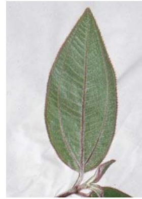
89 U. Zag 481 (lower leaf surface)