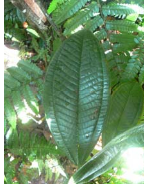
88 M. matthaei (upper lf. surface)

Habitat: Forest. Habit: Shrub. Height <Xm ID tip: Dense pale brown hairs on stems and veins underneath leaves.