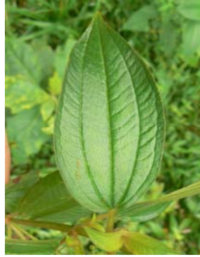
73 U. Zag 239 (upper lf. surface)