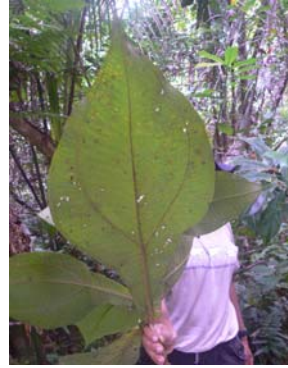
33 M. amplexans (lower lf. surface)