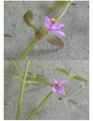
5 A. quadrata (flowers)