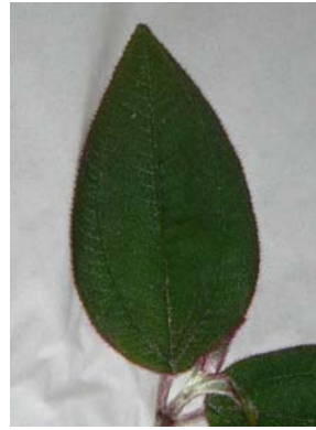
88 U. Zag 481 (upper lf. surface)