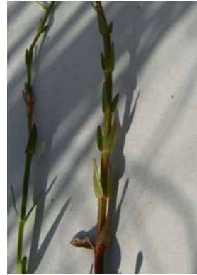
9 A. bivalvis (leaves)