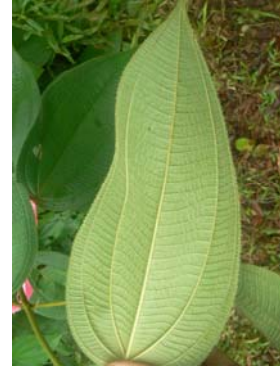
59 C. capitulata (lower lf. surface)