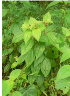
52 C. hirta (habit)