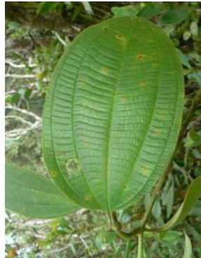
43 T. guianensis (upper lf. surface)

ID tip: Swellings (domatia, usually associated with ants) at base of some leaves, leaves often unequal in size.