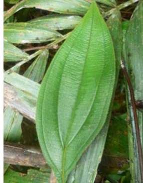
83 M. nervosa (upper lf. surface)

Habitat: Gaps in forest canopy. Habit: Shrub. Height: <5m ID tip: Venation, pink-tinged terminal inflorescences.