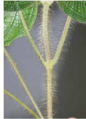
89 U. Zag 481 (detail)