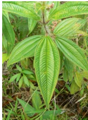
88 U. Zag 538 (upper lf. surface)