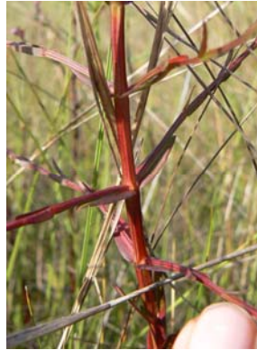
8 A. bivalvis (stem)

Habitat: Open, wet ground, flooded savannah. Habit: Delicate herb. Height: <50cm ID tip: Tiny herb, square stem, large scythe-shape anther connectives.