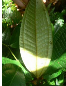
89 M. matthaei (lower lf. surface)