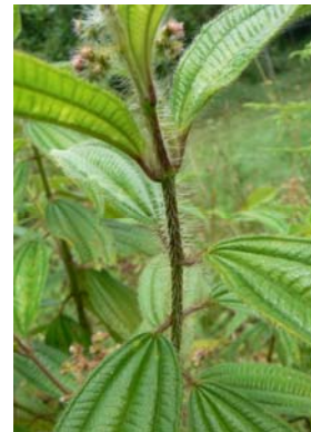
89 U. Zag 538 (detail)