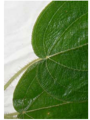
90 U. Zag 480 (detail)