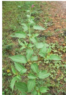
7 A. ciliatum (habit)

Habitat: Open, disturbed vegetation. Habit: low, scrambling herb. Height <1m ID tip: Square stem, often glandular hairs.