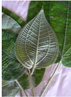
88 U. Zag 481 (lower lf. surface)