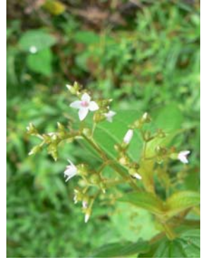
75 U. Zag 239 (flowers)