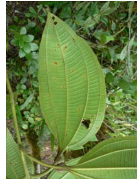
44 T. guianensis (lower lf. surface)