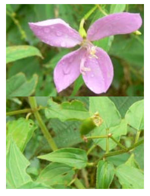
10 A. ciliatum (flower/fruits)