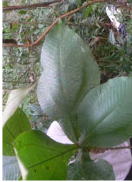
32 M. amplexans (upper lf. surface)

ID tip: Large leaves (60x30cm), with unique shape & venation.