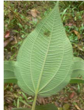
64 L. mexicana (lower lf. surface)