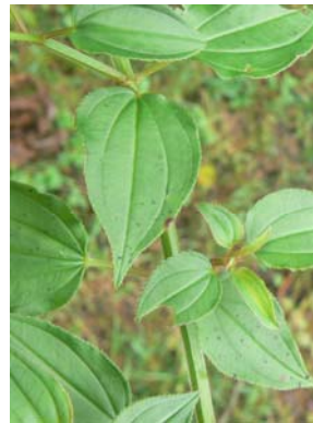
8 A. ciliatum (upper lf. surface)