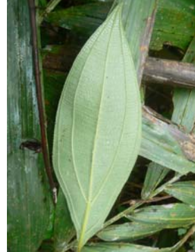
84 M. nervosa (lower lf. surface)