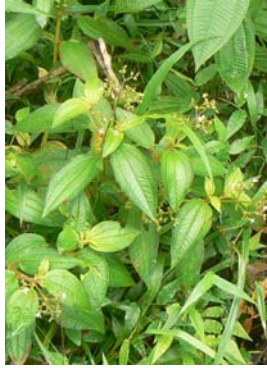
72 U. Zag 239 (habit)

Habitat: Open, disturbed vegetation. Habit: Small shrub. Height: <50cm ID tip: dunno.