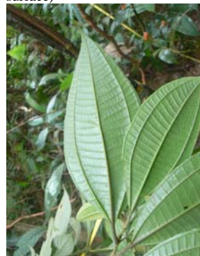
68 M. hyperprasina (lower lf. surface)