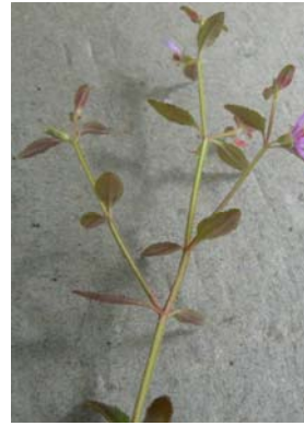
4 A. quadrata (habit)