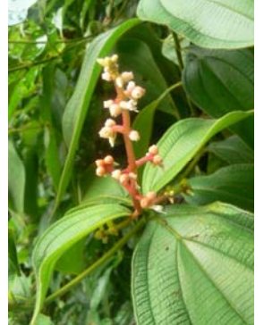
85 M. nervosa (flowers)