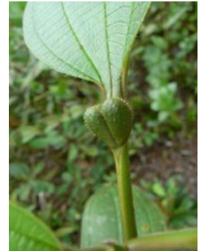
45 T. guianensis (detail)