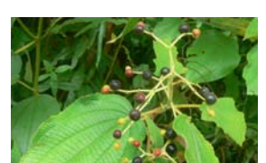
65 L. mexicana (flower/fruits)