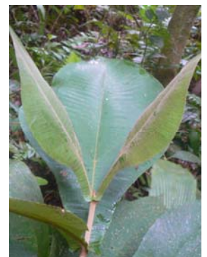
35 M. amplexans (habit)