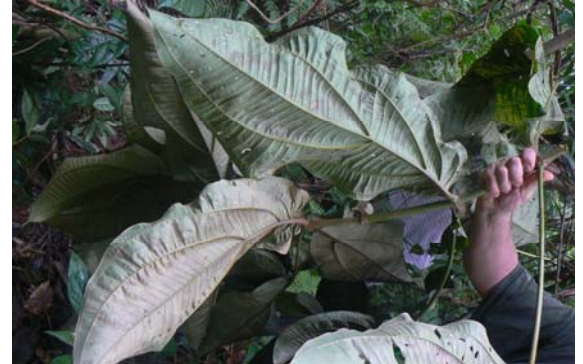
39 U. zag 229 (lower lf. surface)