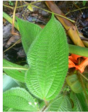
53 C. hirta (upper lf. surface)