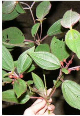
87 U. Zag 481 (detail)