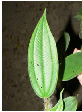
88 U. Zag 482 (upper lf. surface)