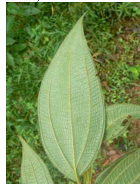
49 C. dentata (lower lf. surface)