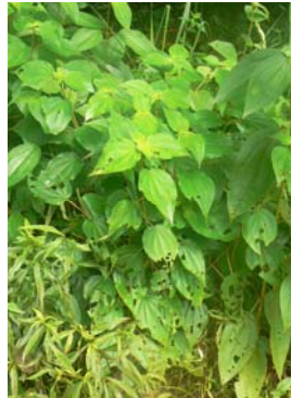
62 L. mexicana (habit)